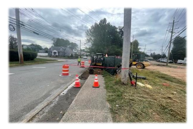
Curb Removal for Installing of New Curb Cut Out