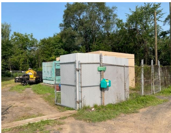
The foam boards around the fence near the generator that will help reduce noise during operations.