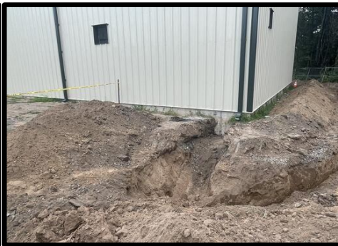
Trench for Electrical Service to New Building