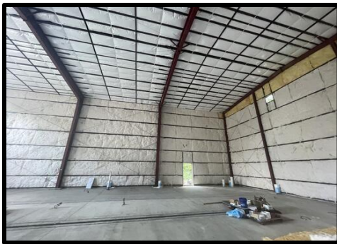
Building Interior Wall Insulation Install