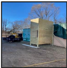
Wood Box constructed to reduce noise from generator.